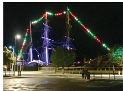
Dunbrody Famine Ship in New Ross