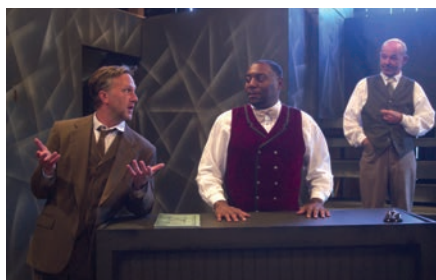
Production of Hughie at Tao House