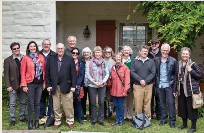
Society Members tour Tao House during ALA conference