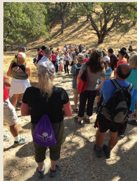
Over 80 guests introduced to the history of O'Neill's "Hills of Solace" at O'Neill Festival at Tao House