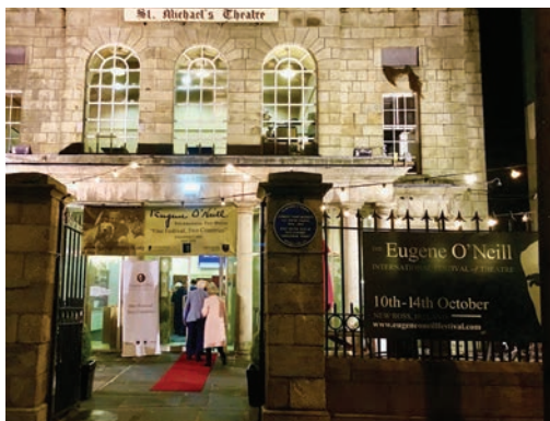
St. Michael's Theatre in New Ross