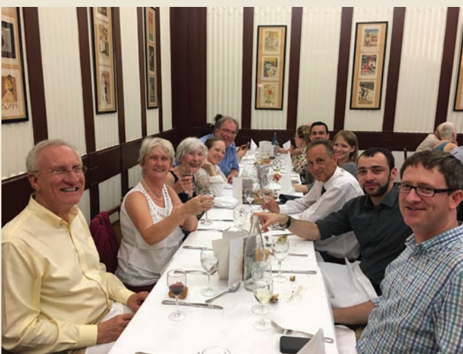
Members enjoying a banquet meal in Nancy, France at the American Theatre Idea Conference, June 2018