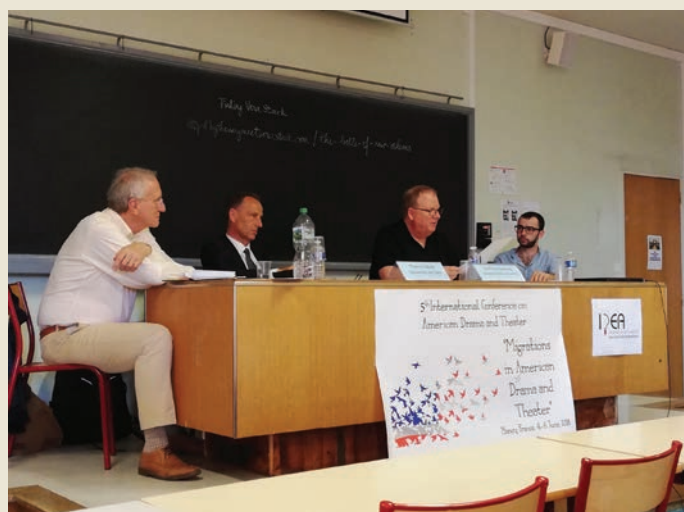
One of the two O'Neill Society Panels at the American Theatre Idea Conference in Nancy, France, June 2018